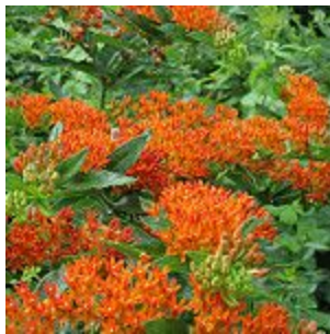
Milkweed ( Asclepias spp.)