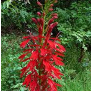
Cardinal flower ( Lobelia cardinalis )