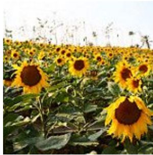
Sunflowers ( Helianthus spp.)