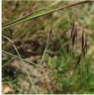
Purple Needlegrass ( Nassella pulchra )