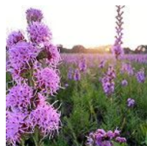
Blazing Stars ( Liatris cylindracea )