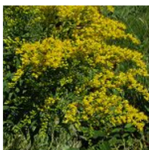
Goldenrod ( Solidago )