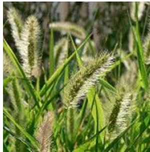
Foxtail ( Alopecurus )