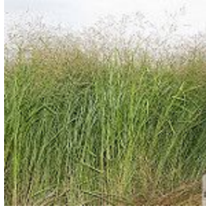
Switchgrass ( Panicum virgatum )

Wildflowers also grow well in grasslands and help attract wildlife to grasslands. Popular flowers that you might find growing in grasslands are asters, goldenrod, blazing stars, partridge pea, sunflowers, and wild indigos.