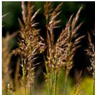
Indiangrass ( Sorghastrum nutans )