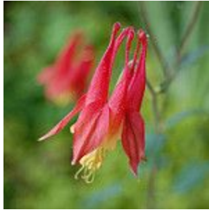
Red columbine ( Aquilegia canadensis )