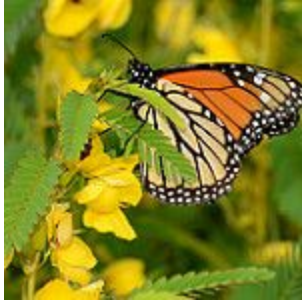
Partridge pea ( Chamaecrista fasciculata )