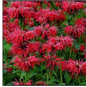
Bee balm ( Monarda fistulosa )