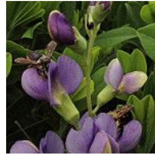
Wild Indigos ( Baptisia australis )