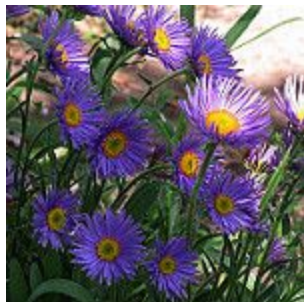
Aster ( Aster amellus )

Wildflowers also grow well in grasslands and help attract wildlife to grasslands. Popular flowers that you might find growing in grasslands are asters, goldenrod, blazing stars, partridge pea, sunflowers, and wild indigos.