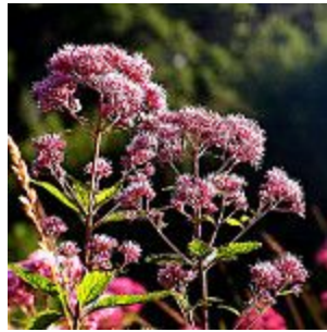
Joe-pye weed ( Eupatorium maculatum )

All these plants are perennials so once you plant them they should return every year.